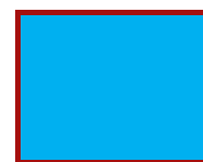
Non-Student Contact Work Day