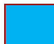
Non-Student Contact Work Day